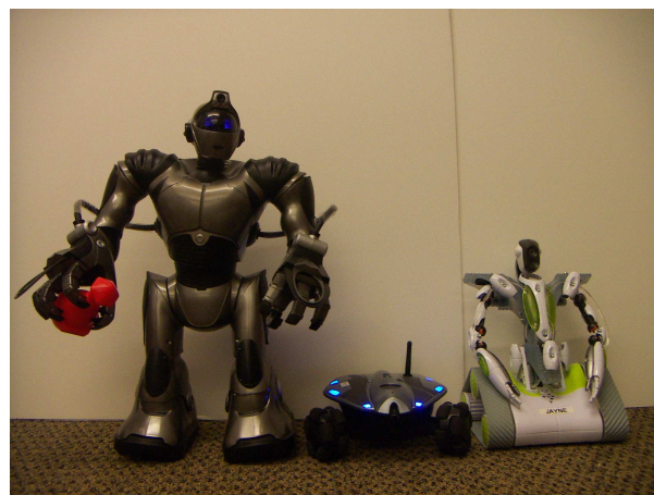
Figure 1. The WowWee RoboSapien V2 holding a toy bowling pin that came in its packaging (left), the WowWee Rovio (middle), and the Erector Spykee (right).

No discussion of robotic safety would be complete without a discussion of Asimov's seminal Three Laws of Robotics, which were introduced in [5] and explored in several subsequent collections and novels; however, researchers have since stated that these laws alone are not sufficient to govern