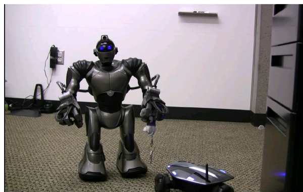
Figure 3. The RoboSapien holding a set of keys in front of the Rovio.

Multi-robot attack scenarios are particularly challenging to thwart because they are outside the normal scope of security and safety considerations. Even if a robot manufacturer carefully considers the safety and security implications of its particular model and makes design decisions to mitigate those risks, the robot may still pose a security hazard when deployed in an environment with other robots.